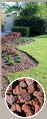
RED VOLCANIC ROCK