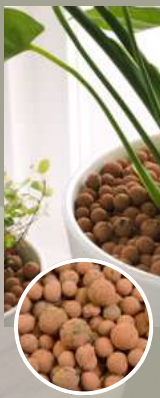
EXPANDED CLAY AGGREGATE