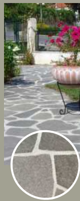
NATURAL STONE PAVING SLABS

AUTHORIZED STIHL DEALER AND SERVICE CENTER FOR MOTORIZED AND ELECTRIC EQUIPMENT